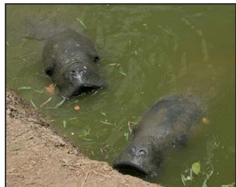
West Indian manatees at the Guyana Zoo.

To see more pictures, visit www.ascp.org/outreach/pepfar/ and click on “photos.”