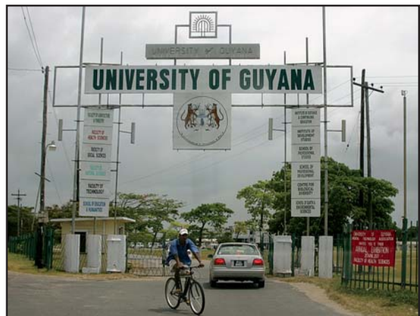
ASCP conducted a Training of Trainers at the University of Guyana.