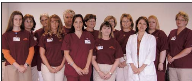
Lab staff at Montgomery Regional Hospital

locked morgue, guarded by security. The remaining victims were taken from the crime scene to the local forensics lab in Roanoke. (The hospital lab staff are not involved with identifying the deceased.)