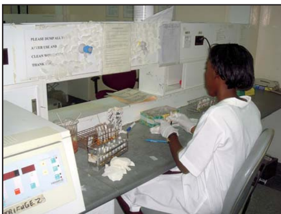
The hematology department at Georgetown Public Hospital.

To see more pictures, visit www.ascp.org/outreach/pepfar/ and click on “photos.”